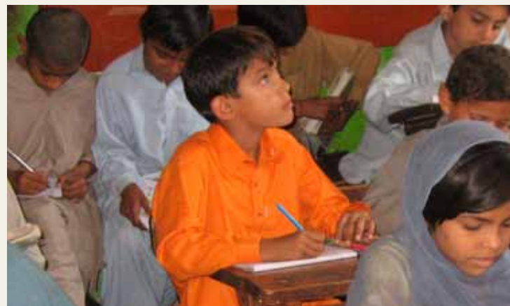
An Orphan working on an assignment in class at one of Hidaya's Schools in Pakistan