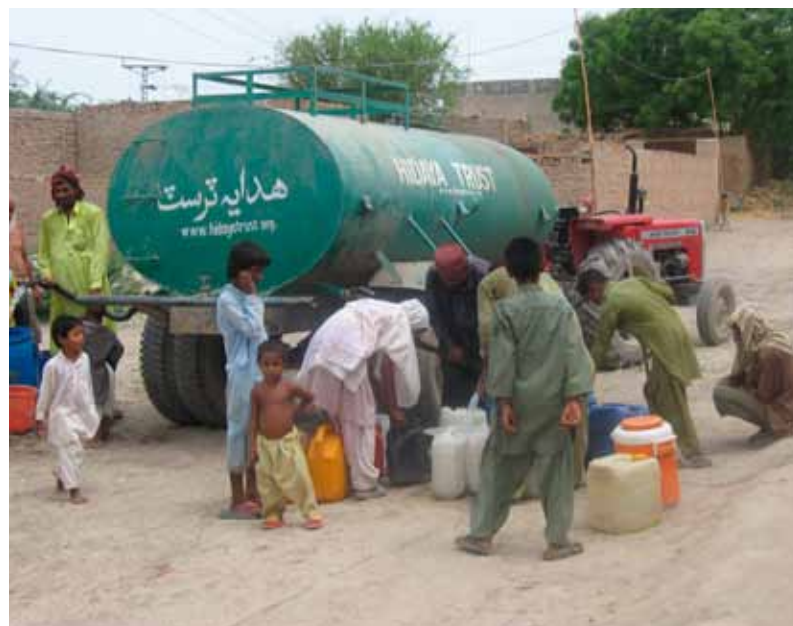
One of Hidaya's Water Tankers making a stop to give water to families in Sukkur, Pakistan

So far in 2011, a total of 325 Water Hand Pumps have been installed, and around 3 million liters of water have been distributed via water tanker. ♦