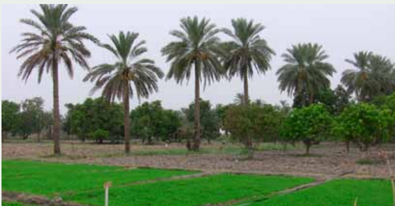
Hidaya's rice crops, date palms, and mango trees which are managed by HIFA students

Just $50 per month is enough to support one such youth under this effort. ♦