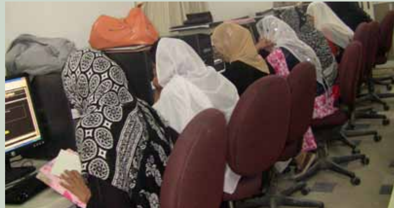
Female Interns learning in Software Development Training class at HIST