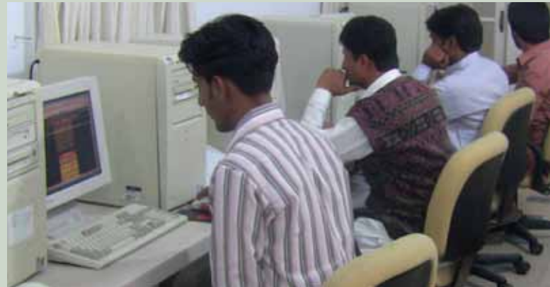
Male Interns learning in Software Development Training class at HIST

Hidayah's Information & Communication Technology Program includes the following projects, each of which is a class for intern students: Basic Computer Skills, Software Development Training, System Administration Training, Network Administration Training. HIST has the capacity to train 140 interns every 4 months in Software Dev. Training, and 40 interns every 2 months in System Administration & Network Administration. ♦