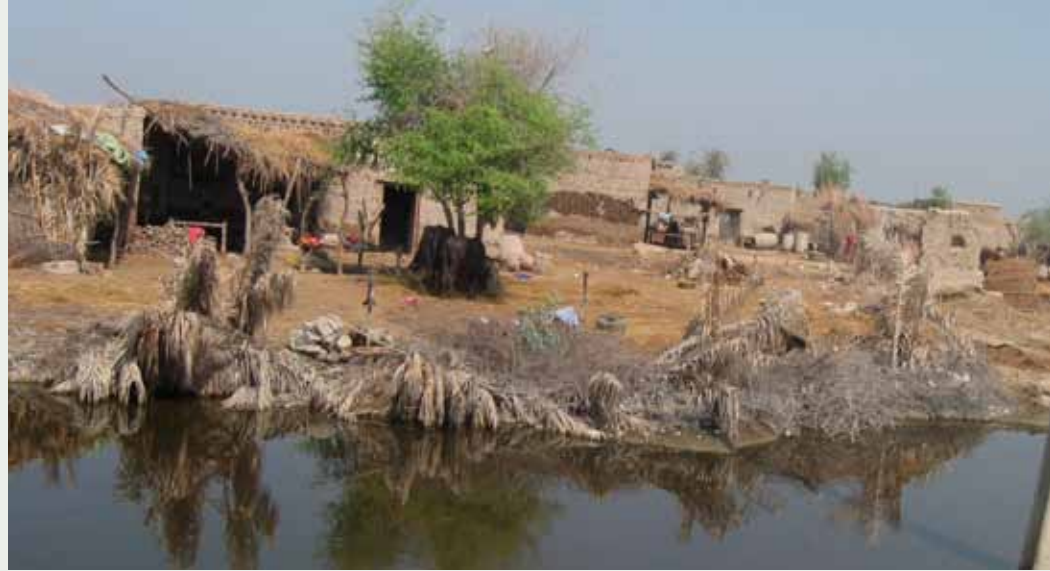
A poor village is visited and investigated by Hidaya's team under the one village at a time methodology

Alhamdulillah, as Hidaya's infrastructure has grown, we have been able to implement a "One Village at a Time" infrastructure, which is more of a push method. Now our team members go to impoverished villages and visit each family to understand their needs and the needs of the village as a