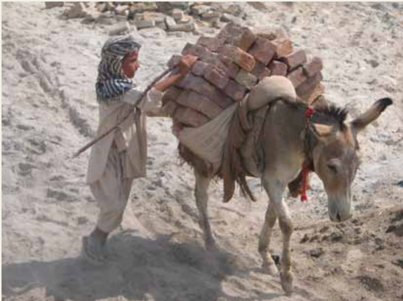
Countless poor children such as this one miss out on receiving an education to work long strenuous days to earn meager wages for their families and caretakers.

Due to extreme poverty, orphans in poor countries suffer more than any other group. Often times, they are sent to work for meager wages from a very young age to support their widowed mothers or caregivers. In doing so, these bright young children miss out on receiving a proper education, preventing them from ever reaching their full potential.