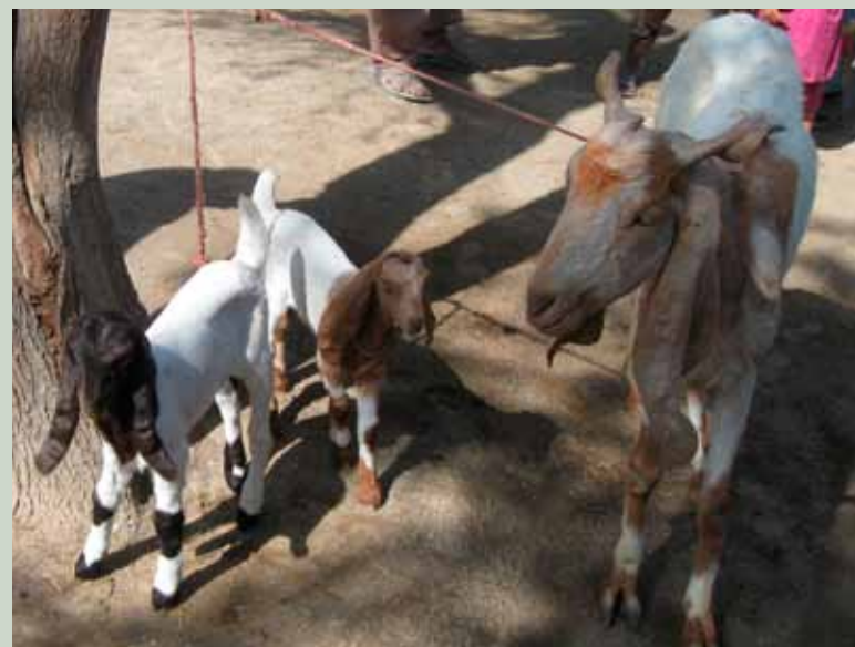
Goats given to a family for Animal Farming Project

Hidayah Foundation strongly believes that it is much better to help people become financially independent and self sufficient, rather than just providing them constant assistance. With this in mind, Hidayah expanded its Self Employment Project which was formerly under the Social Welfare Program, and made it into its own program to give it the importance deserved in hopes to raise awareness of this great need in the developing world. Under our Self Employment Program we currently have the following projects to help families get out of the cycle of poverty and stand on their own feet: