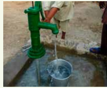
Clean Drinking Water - Water Hand Pump