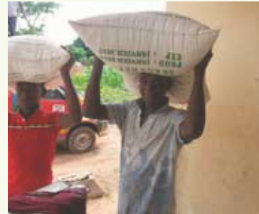
One Million Meals - Dry Ration Distribution