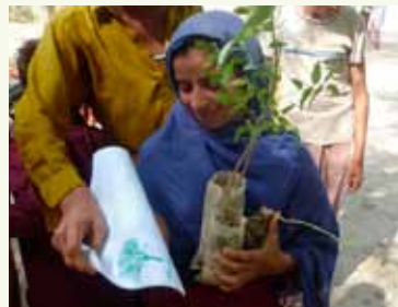
One Million Trees - Seedling and Information Distribution

No Orphan without Education: Supported over 10,000 orphans each month