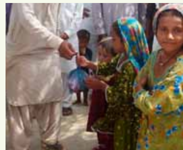
Sadaqah Sacrifice - Meat Distribution