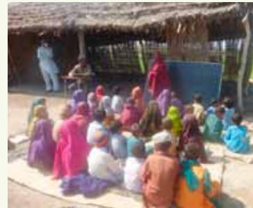
Support Hidaya Schools